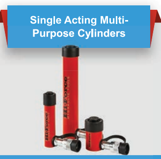
Capacity: 4.5 -109 Tonnes Stroke: 25 - 457 mm