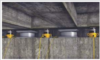
LIFTING and BEARING REPLACEMENT