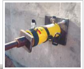
ANCHOR BOLT, ROD and CABLE TENSIONING and TESTING